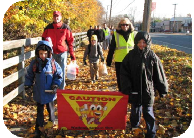
Park and Walk to School