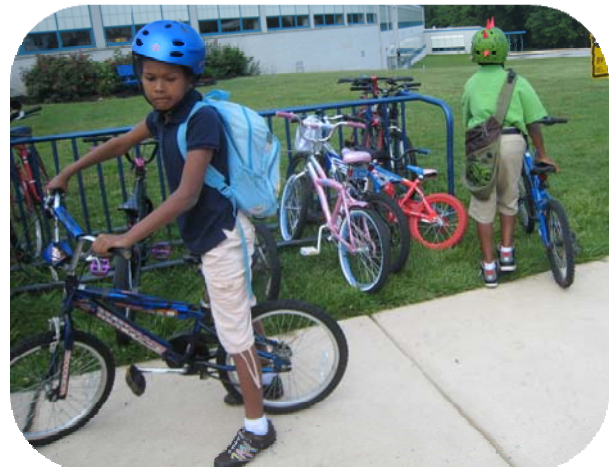
Walk and Bike to School