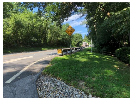
Photo 2: Southbound Hickory Spring Rd corner sight distance looking right onto SR 48 (from "stop line")