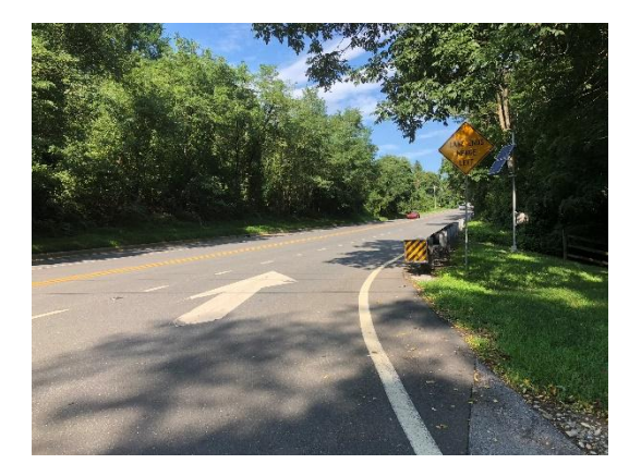
Photo 3: Southbound Hickory Spring Rd corner sight distance looking left onto SR 48 (beyond "stop line") distance looking right onto SR 48 (beyond "stop line")

Photo 2: Southbound Hickory Spring Rd corner sight distance looking right onto SR 48 (from "stop line")