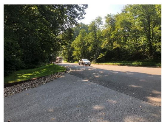
Photo 1: Southbound Hickory Spring Rd corner sight distance looking left onto SR 48 (from "stop line")