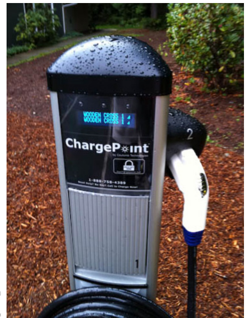
A 6 kW (Level 2) public charging station

There are different charging levels, each with varying charging speeds and costs. Home charging from a regular electric socket, Level 1 (4.5 mi/hr), generally involves an overnight charge. Level 2 (26—75 mi/hr) charging stations are found both in homes and in public places. These units typically cost under $3,000 for purchase and installation. Direct current (4 mi/min) stations, the fastest available, are found in public places and require a $30,000 investment per unit, excluding installation.