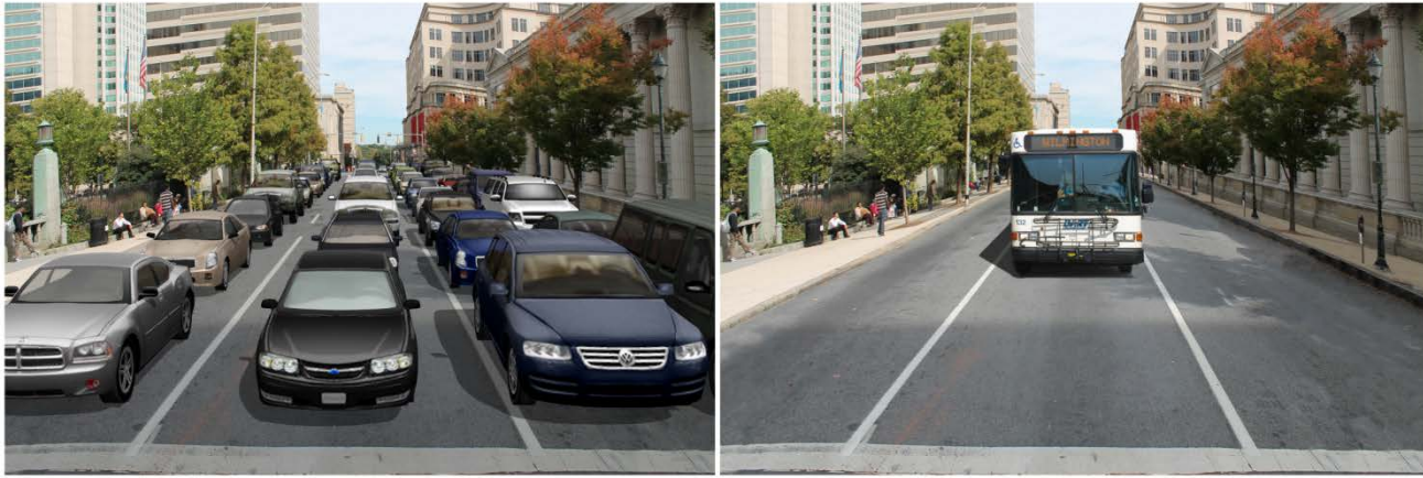
42 cars vs. 1 bus on King Street