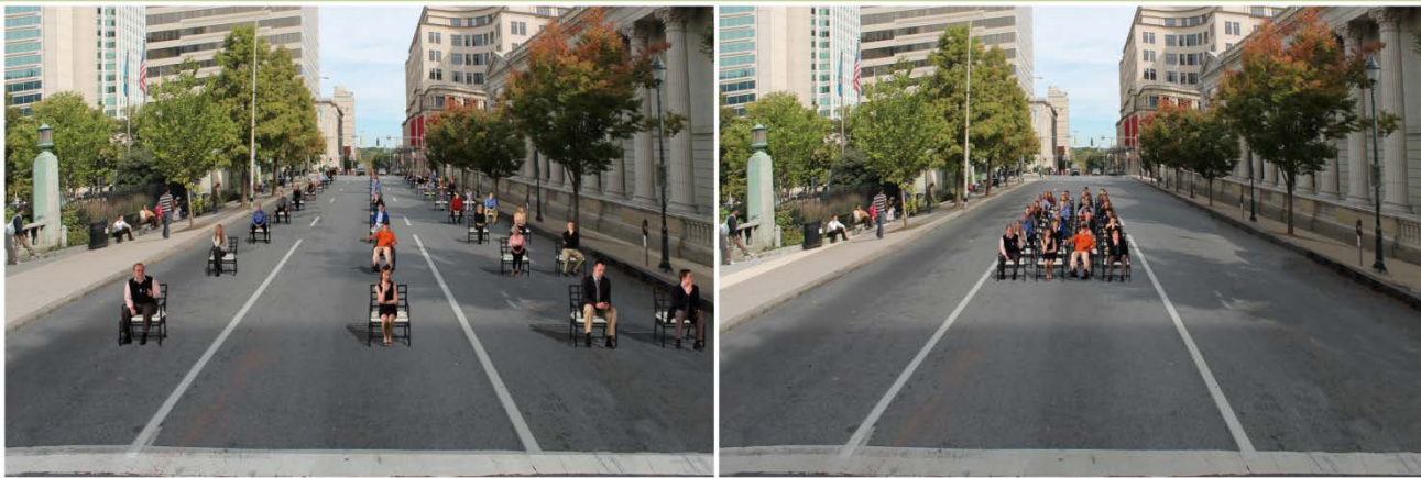
42 single occupant car drivers vs. 42 passengers on 1 bus on King Street