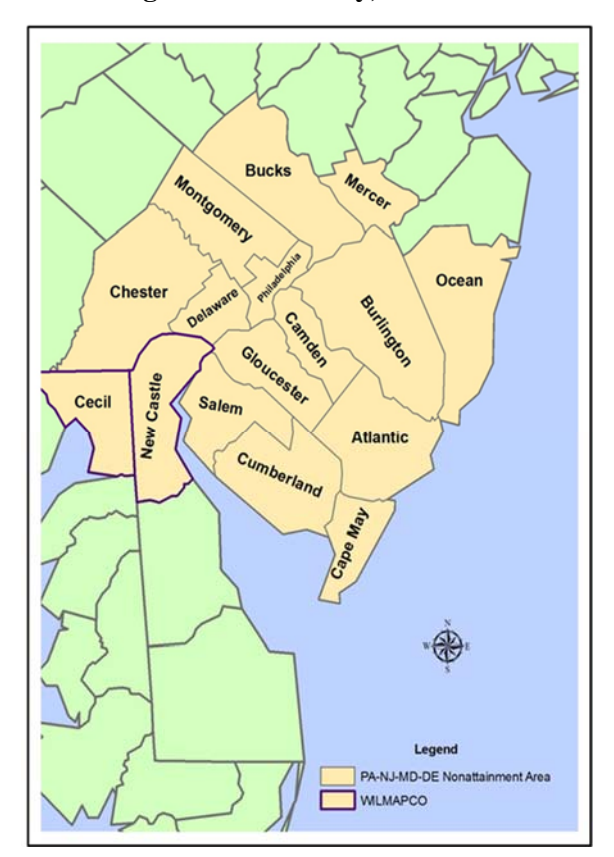
Figure 1: Philadelphia-Wilmington-Atlantic City, PA-NJ-MD-DE Nonattainment Areas