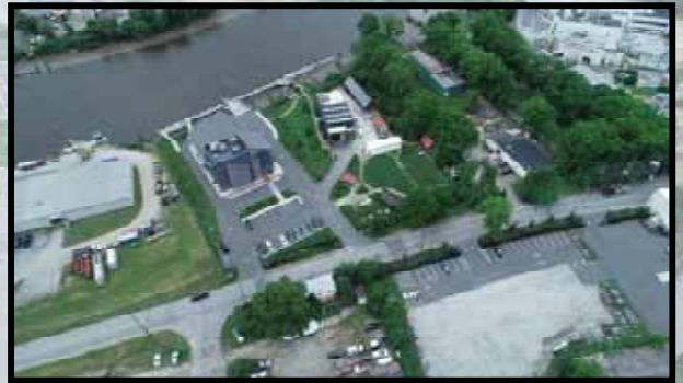
East 7 th Street @ Kalmar Nyckel

The primary purpose of this study is to maximize future growth potential and viability of the East 7 th Street Peninsula through recommended modifications to stormwater management, land-use, and transportation network operations while mitigating flood impacts, enhancing recreational amenities and preserving the culturally and historically significant landmarks on the peninsula.