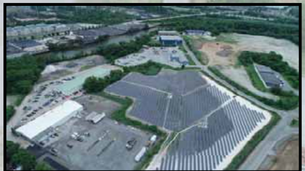
Industrial Street - Heading East