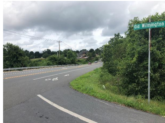
Photo 2: Southbound Old Wilmington Rd corner sight distance looking right onto SR 48 (from stop line)