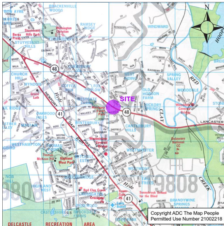
FIGURE 1 Site Location Map