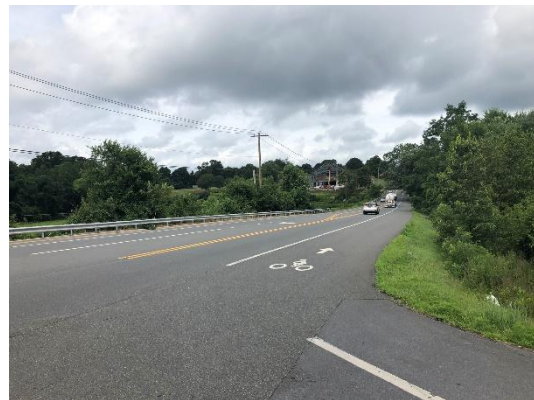
Photo 4: Southbound Old Wilmington Rd corner sight distance looking right onto SR 48 (beyond stop line)