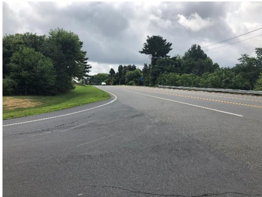
Photo 1: Southbound Old Wilmington Rd corner sight distance looking left onto SR 48 (from stop line)