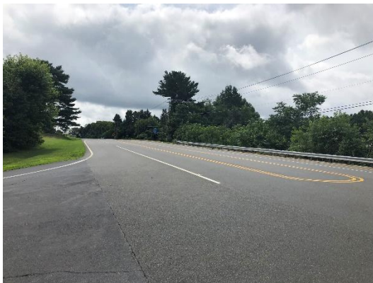
Photo 3: Southbound Old Wilmington Rd corner sight distance looking left onto SR 48 (beyond stop line)