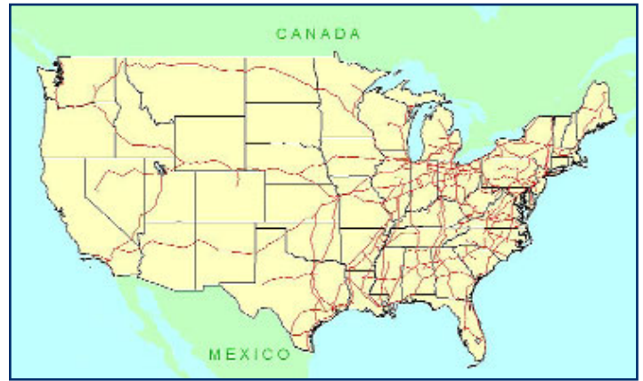
Figure 2. Freight Flows To, From, and Within Delaware by Rail: 1998 (tons)