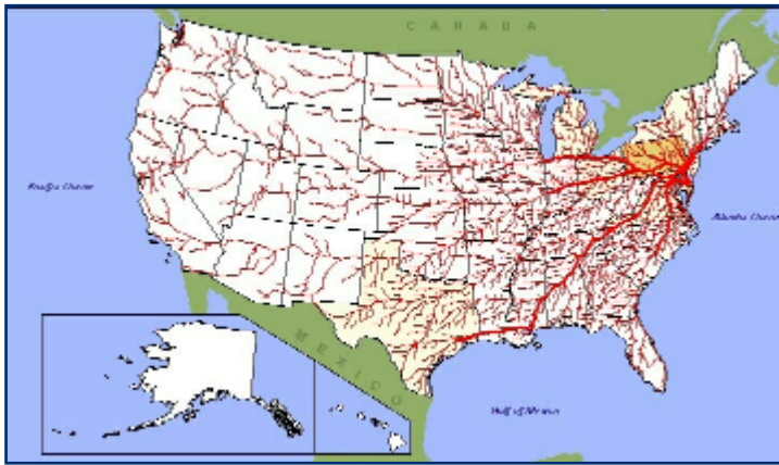
Figure 1. Freight Flows To, From, and Within Delaware by Truck: 1998 (tons)