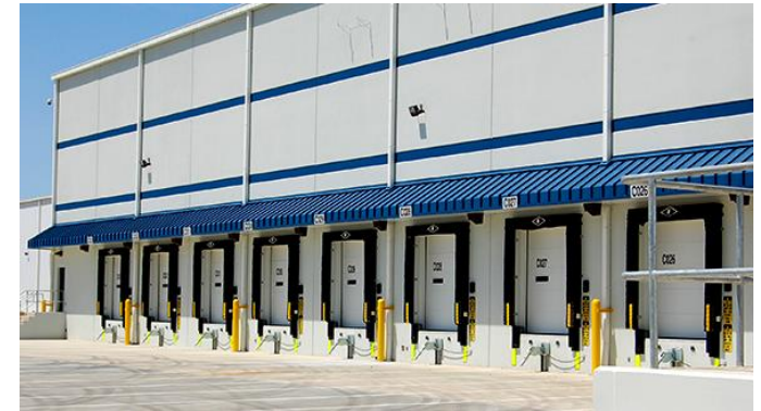
Fast Moving Consumer Goods Supply Chain