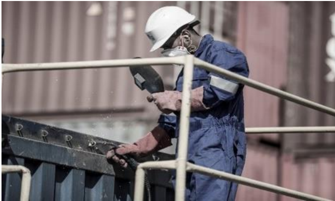
Container, Chassis, Genset repair