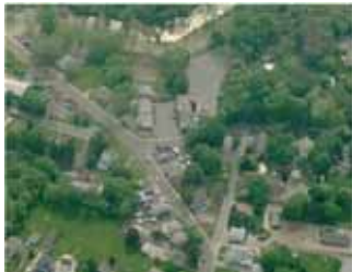
Bing Maps, 2011