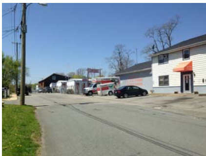
As it is