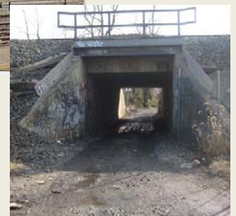
As it is

Tell us how you envision North East in the future!