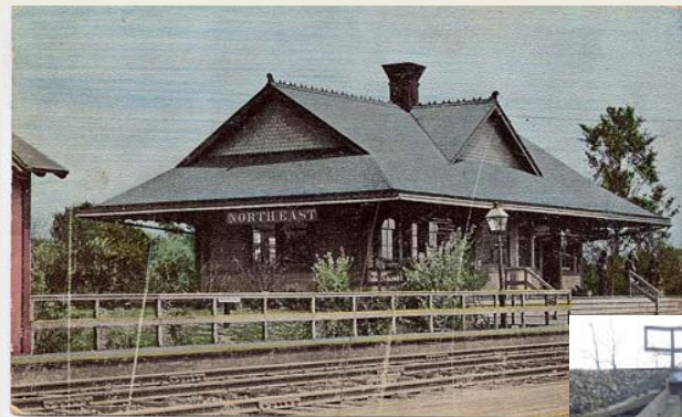
As it was

This plan is being developed by the WILMAPCO, in partnership with the Town of North East, Cecil County and the Maryland Department of Transportation. WILMAPCO is the regional transportation planning agency for Cecil County, Maryland and New Castle County, Delaware. Throughout the planning process, we will be coordinating with local leadership, land owners, major employers, residents and other interested stakeholders. Outreach and technical support is being provided by KSK Architects Planners Historians, Inc., Pennoni Associates, and Real Estate Strategies.