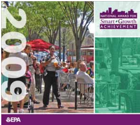
Overall Excellence in Smart Growth Brownfield Phoenix Award Lancaster County, PA 2009