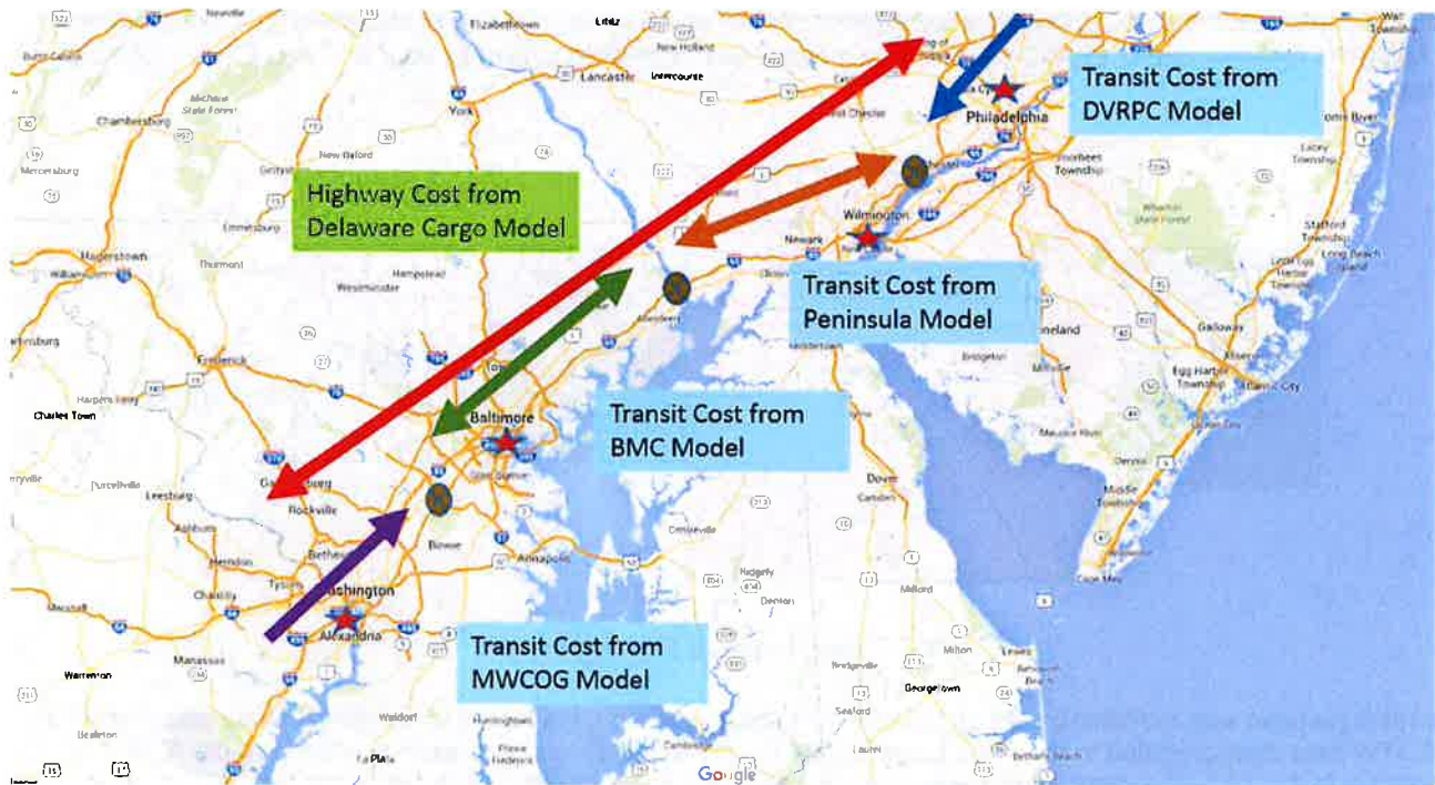
Figure 3: Transit and Highway Cost Skim MPO Sources