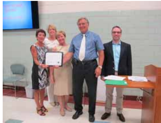
Colonial District Award