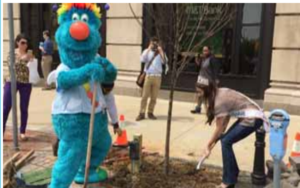
Tropo and Ms. Delaware plant a tree on Market Street, Wilmington Earth Day