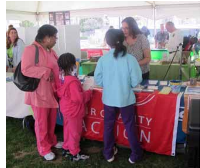
Wilmington Earth Day