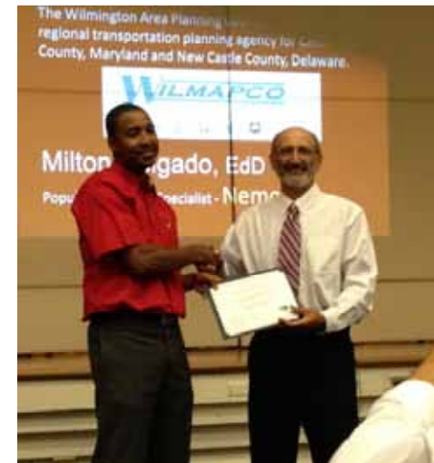
Award presented to district.