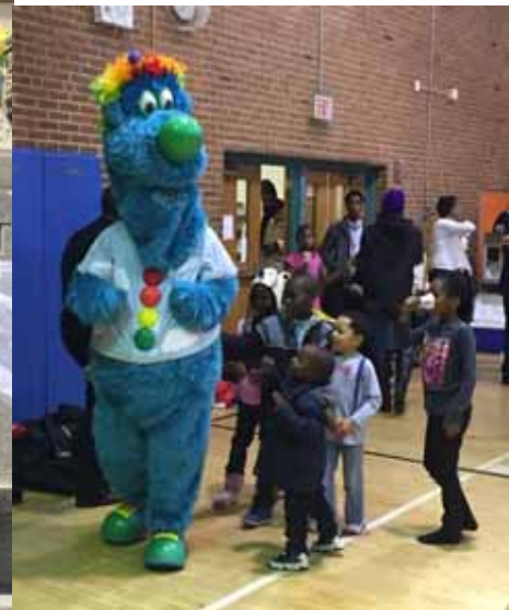
Stubs ES Resource Night