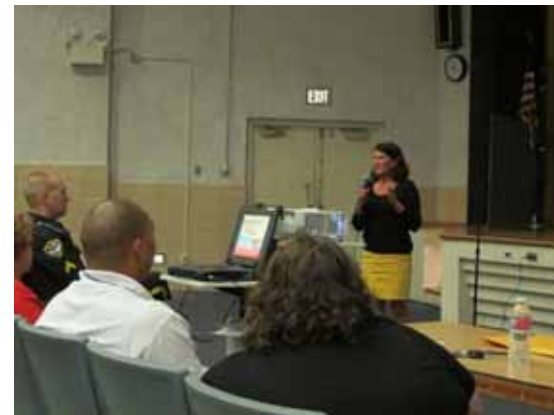
Christina District Presentation