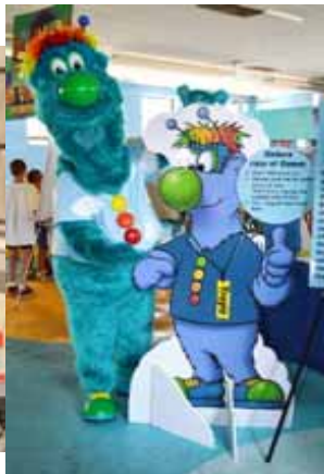
DE State Fair