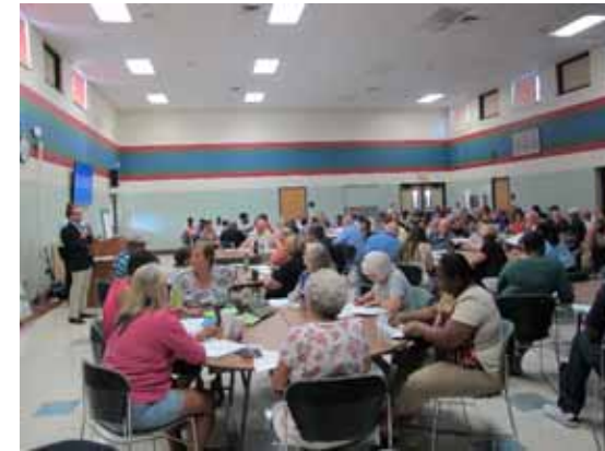
Colonial District Presentation