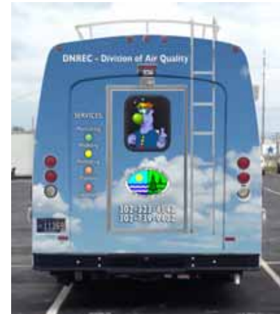
DNREC AQ Monitoring Van Wrap