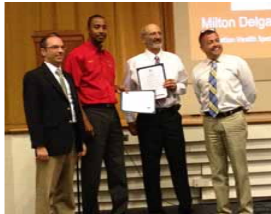
Christina District Award