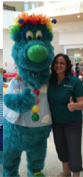
World Asthma Day