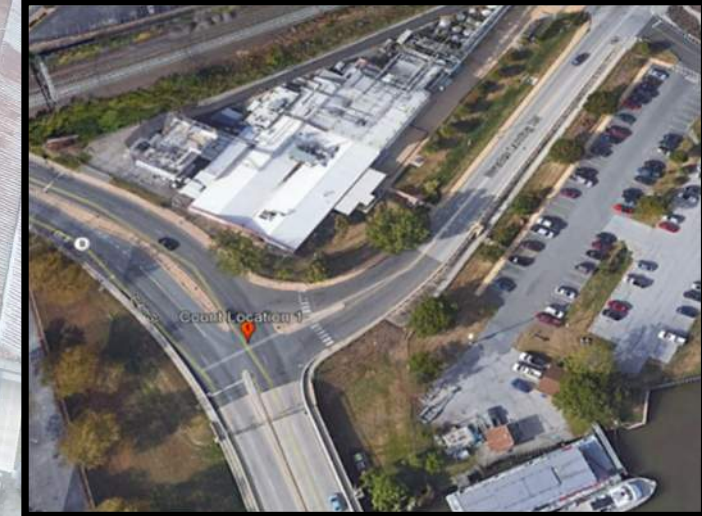
Existing Transportation Network