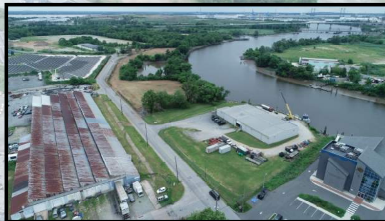
East 7 th Street - Heading East

The primary purpose of this study is to maximize future growth potential and viability of the East 7 th Street Peninsula through recommended modifications to stormwater management, land-use, and transportation network operations while mitigating flood impacts, enhancing recreational amenities and preserving the culturally and historically significant landmarks on the peninsula.