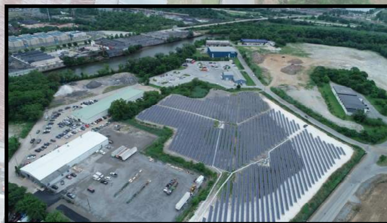
Industrial Street - Heading East